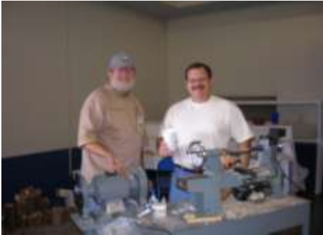
School Day Tours