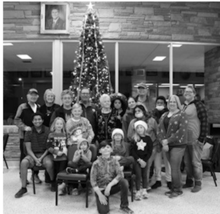
Christmas Light judging at Boys Ranch!